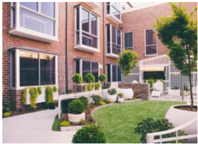
Pathways Sailors Bay 170 Sailors Bay Road, Northbridge NSW 2063